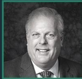
JIM ROSS Mayor of Arlington