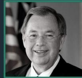
GLEN WHITLEY Tarrant County Judge