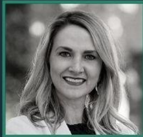
MATTIE PARKER Mayor of Fort Worth